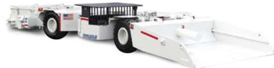
Model 35C-XL Low Profile Scoop