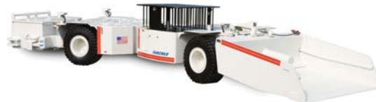
Model 35C-WH Workhorse Scoop

If running an efficient continuous mining operation is one of your top priorities, purchasing a Fairchild scoop should be too. To learn more about how our equipment can improve your mining efficiency and production please give us a call at 540-726-2380, or visit www.fairchildint.com